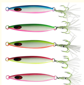
Packaging to show